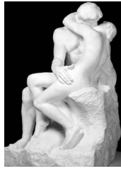
The Kiss by Auguste Rodin (1840-1917).

The first question in all ethics is: "What does my behaviour say?" Ethics is learning to behave to each